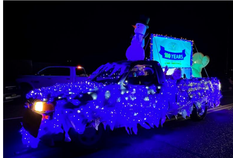
Our parade entry