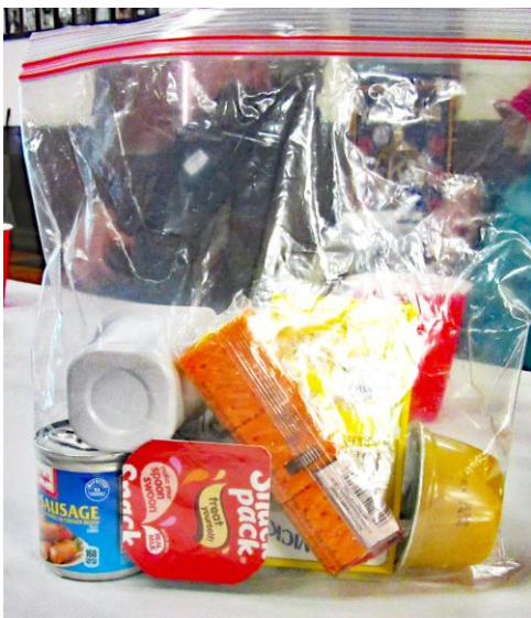
120 Food packets are distributed to the homeless each week

The Sunday Free Meal program is coordinated through Healdsburg Shared Ministries. Each Sunday a different church from town prepares and serves a free meal to all comers.