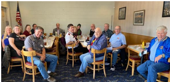
The Healdsburg gang at the Eureka Meeting