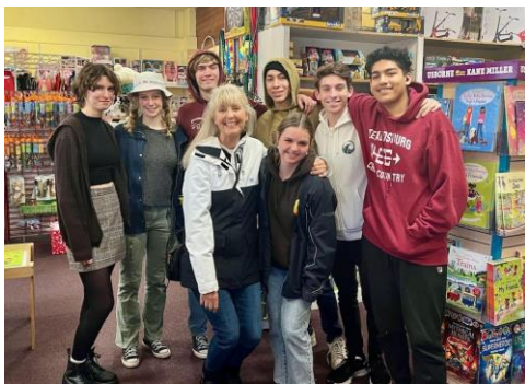
At the Toy Chest