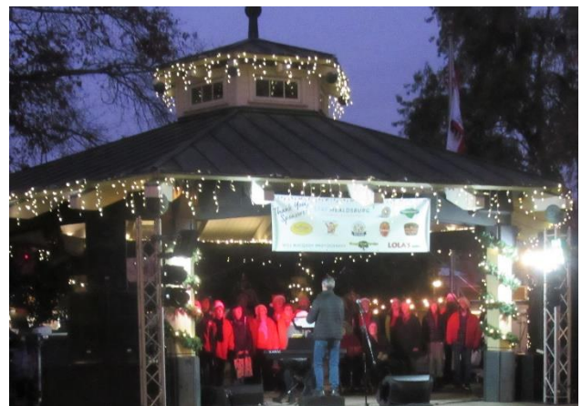
The Healdsburg Chorus