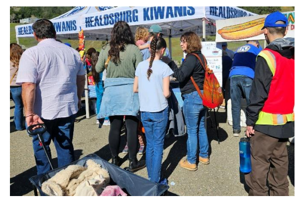
The rush hour crowd