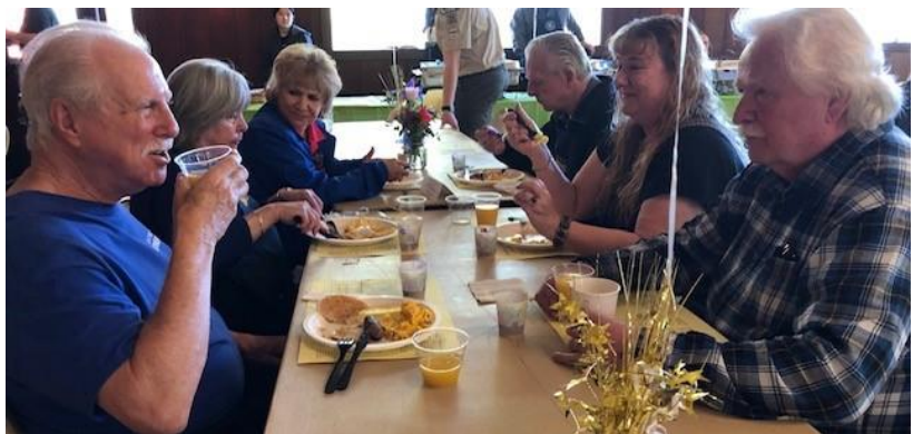
The Sluffers relax after the crowd is fed