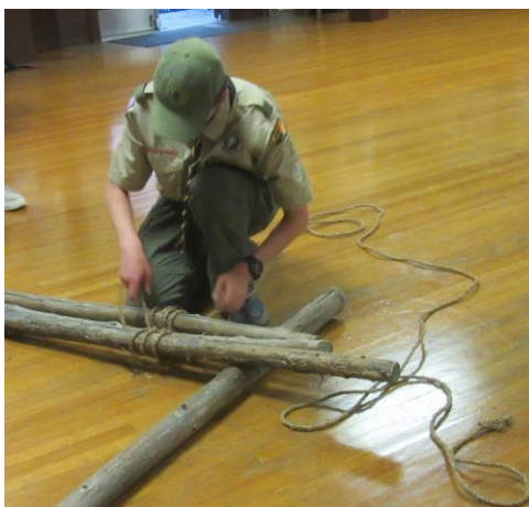
Completing lashing at the apex of the tripod

We all got to be a Scout for the evening learning some skills like lashing and other rope work. The scouts demonstrated lashing poles together to form a tripod, the basic body of a structure to build on.