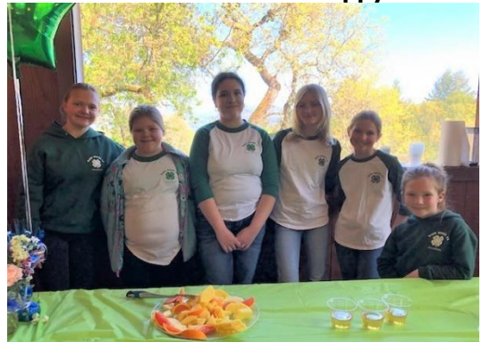
4-H kids ready to serve