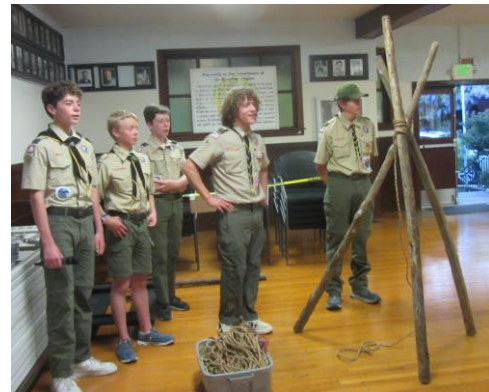
The completed tripod

The scouts also presented a slide show of their year. The busy year started with snow camping at Bear Valley. The snow was 20 feet deep, and it was very cold.