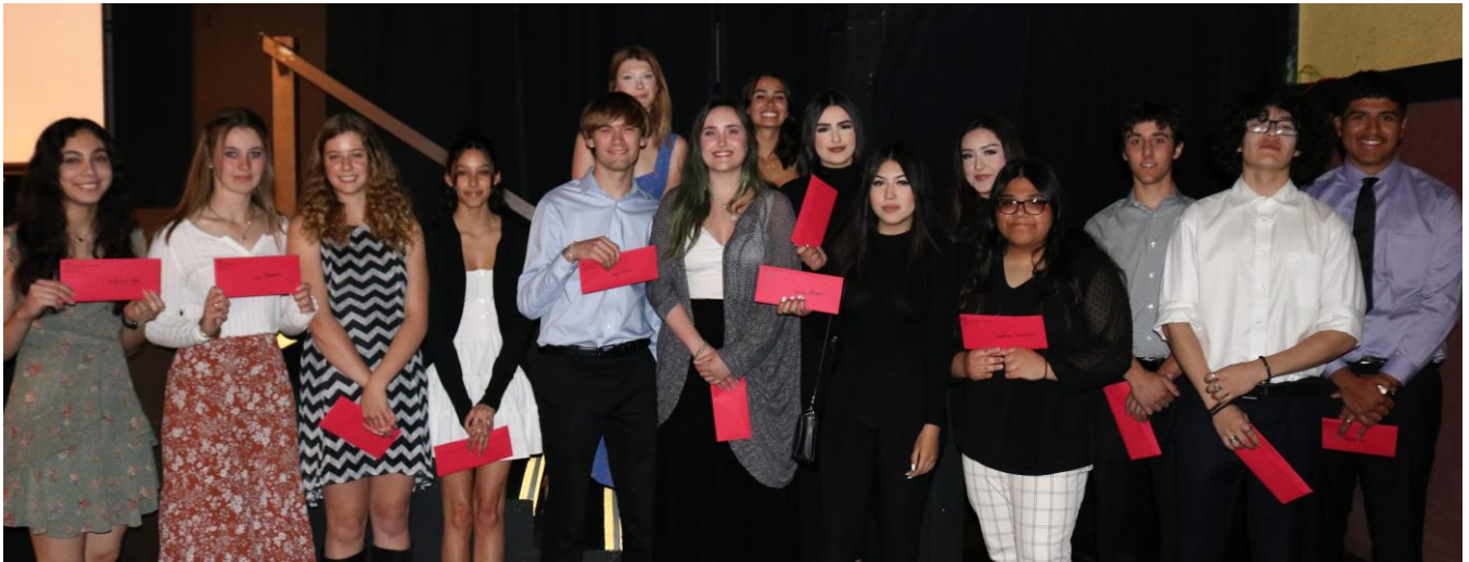
Our 16 Memorial Scholarship winners