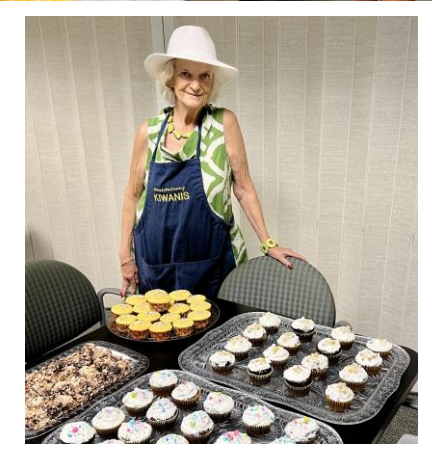
HEALDSBURG KIWANIS CLUB P.O. Box 1156 Healdsburg , CA 95448