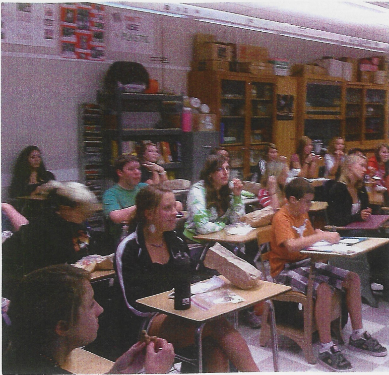
Healdsburg High School students at the orientation meeting of the Key Club