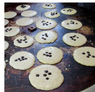
Blueberry Pancakes almost ready to flip