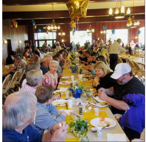
An Eating crew