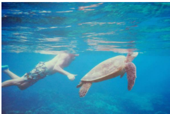
Roger flies with a turtle