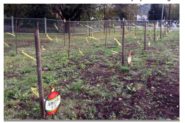
The first shipment of Christmas trees arrived at 8 am November 23 and our lot was ready.