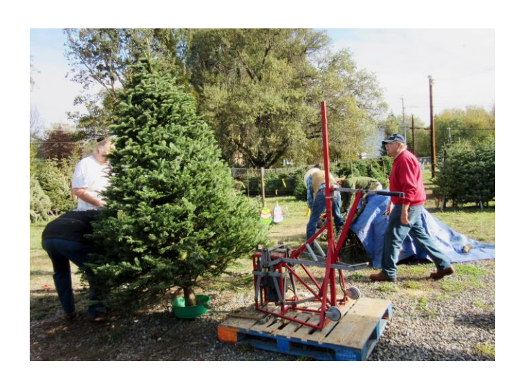
First customers on opening day, Black Friday Gross sales for the first two days were over $12,000