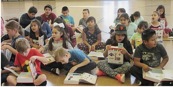
The third graders check out their dictionaries