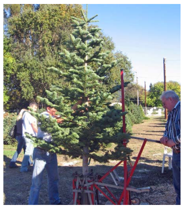
Drilling a Tree Trunk for Stand