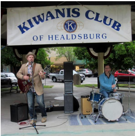
Live entertainment was provided at the Plaza and several locations along the race route