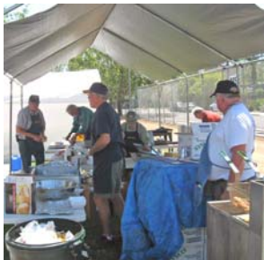
Chaos in the Kitchen

Another positive change was the provision of seating for the customers. Three picnic tables borrowed from the Salvation Army were located in the area near the trailer. This extra comfort proved to be successful in drawing more customers.