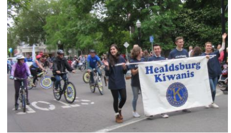
Key Clubbers lead the way