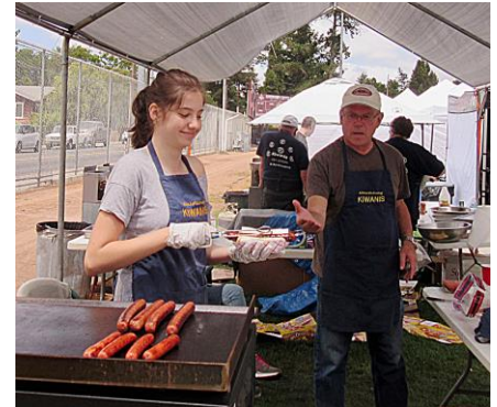
A Key Clubber tends the dogs

HEALDSBURG KIWANIS CLUB P.O. Box 1156 Healdsburg, CA 95448