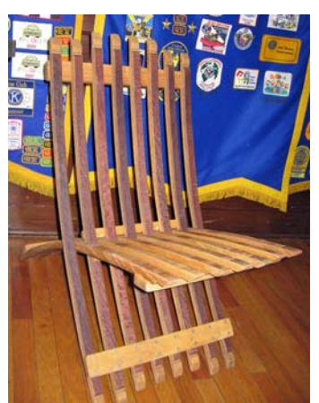
Two of Whit's Products Fashioned from Barrel Staves and Top