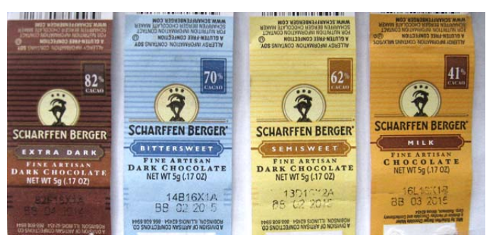
Scharffen Berger Chocolate Fine Artisan Chocolate

process is cacao "nibs" that are 50% solids and 50% cacao butter (fats). The cacao butter is retained for making quality chocolate, but is sold to the cosmetics industry and substituted with other fats for making lesser quality chocolate. A heating process turns the nibs into a paste or chocolate liqueur and sugar is added along with an emulsifier and vanilla bean extract for a flavor enhancer.