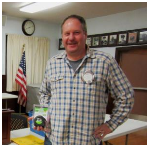
The winner awarded a measuring tape