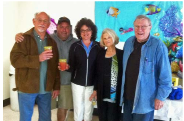
Healdsburg Club Members at the Petaluma DCM/Oyster Feed