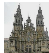
Santiago de Compo Cathedral