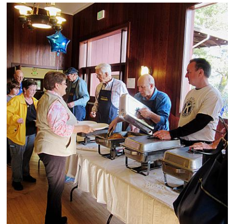
The serving line