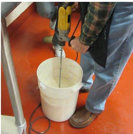
Mixing the batter