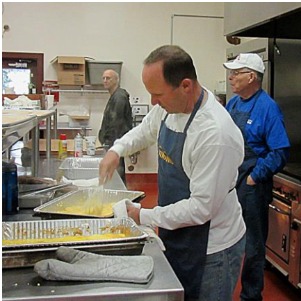
Hunt tends the eggs