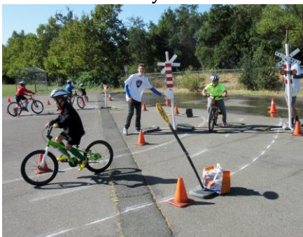
The Bike Rodeo