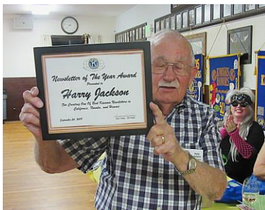
Harry Jackson Newsletter of the Year Award For Creating One of the Best Kiwanis Newsletters in California, Nevada and Hawaii