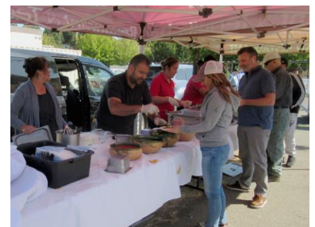
Free taco lunch by Agave