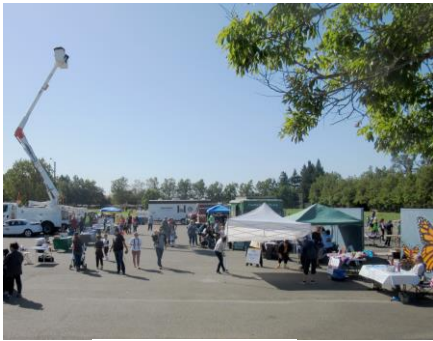
The fair grounds