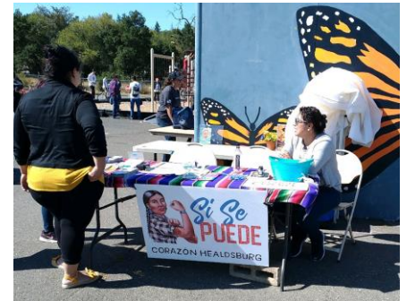
Corazon community outreach