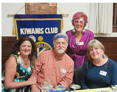
The Fab 4 retiring copresidents