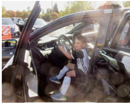
A ride in a CHP car