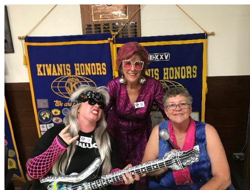
Past, present and future presidents