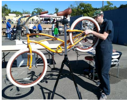
Free bike repair