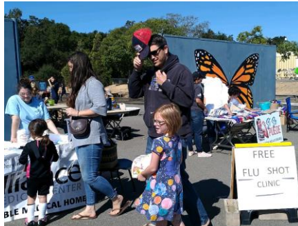
Free flu shots