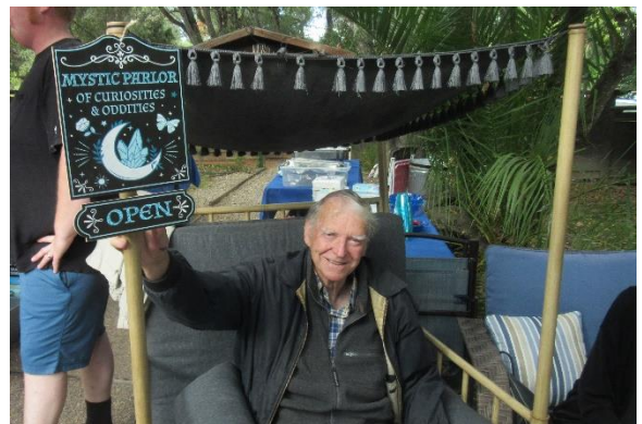
Guy in the Mystic Parlor