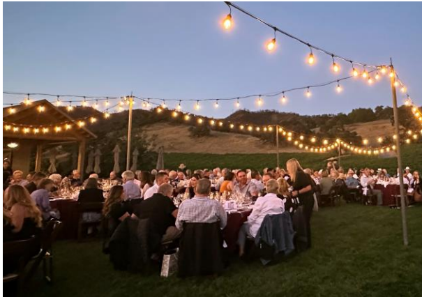
Dinning at sunset

The Pioneer Award recognizes and honors an individual "with deep roots in the local area, strong community involvement and leadership in their profession". healdsburgmuseum.org