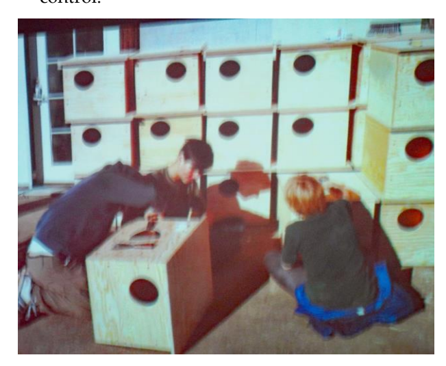
Building Owl Boxes