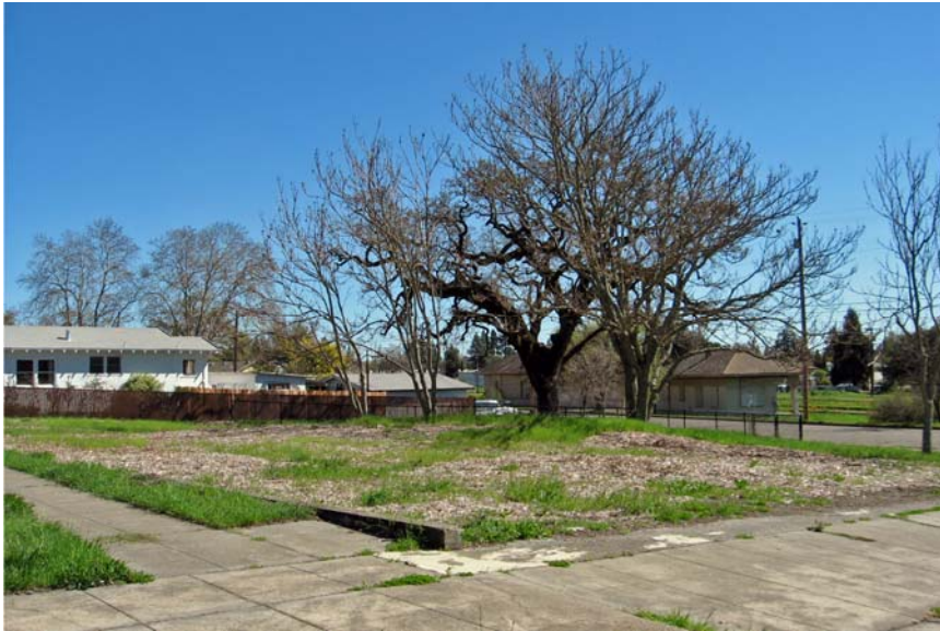
“Before” View of Future Pocket Park

On the morning of April 5, hardy members of Kiwanis, Key Club and Boy Scout Troop 21 will meet at the corner of Fitch and Mason Streets with rakes, shovels and other tools in hand to complete Phase 2 in the creation of a small pocket park. Boy Scout Troop 21 Eagle Scout Candidate Cutler Price is spearheading the final two stages as his Eagle Scout Project. Last fall the Healdsburg High Key Club along with friends completed stage one at the park.