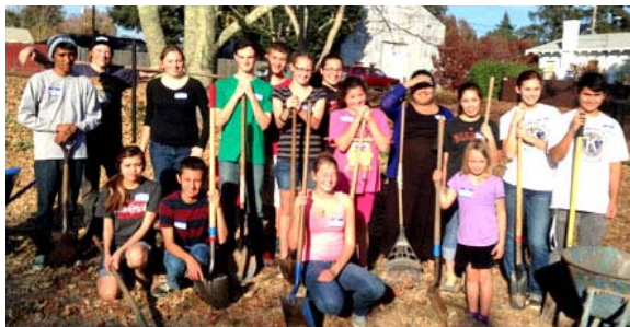
Key Club Work Crew after Completion of Phase 1

The Phase 2 crew will work from 9 to noon on Saturday April 5 with a tasty lunch provided.