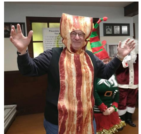
A uniform for Vern the sausage chef (looks like bacon, but close enough)