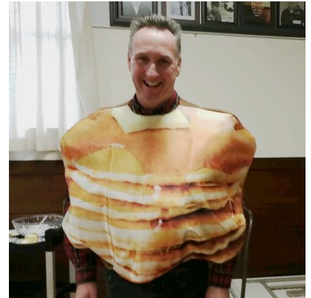
A uniform for Bob the Pancake Breakfast pancake chef