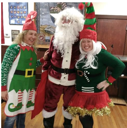
Santa with his elves

Following the meal, Santa appeared for his annual visit. He had a bag full of gifts for a number of members deserving to be embarrassed. See page 5 for photos of the victims and their gifts.