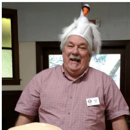
Rowdy, a big guy picked on a lot is really an old pussy cat