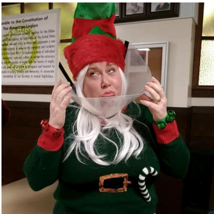
Something to prevent Anna from biting someone's head off