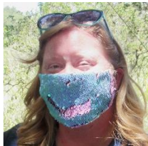
Best face mask