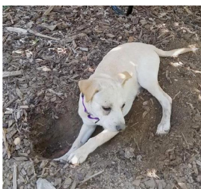
Tyler digging for gophers Cindi's little garden helper