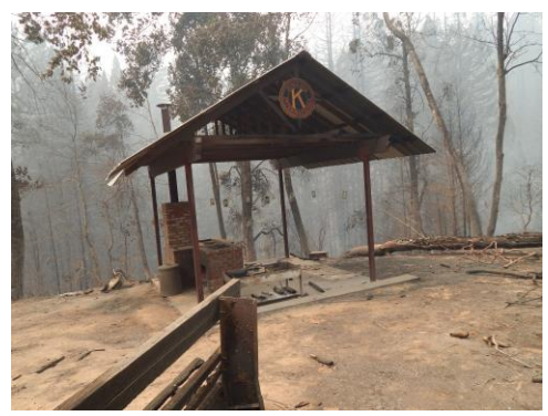
Severe but reparable damage to the dining shelter

Bob provided some photos from his inspection of the fire damage at the scout camp at Camp Rosenburg.