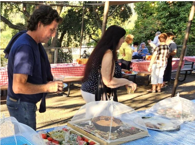
Enjoying the appetizers