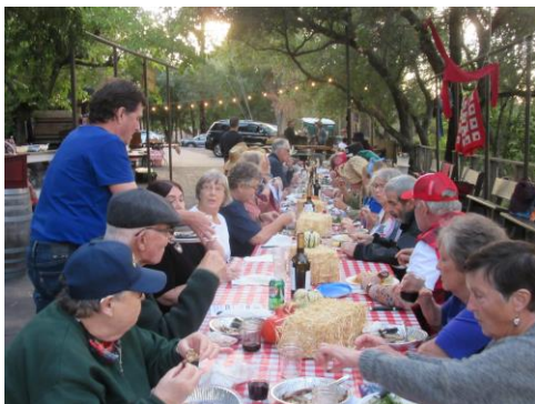
Enjoying the Hoedown supper