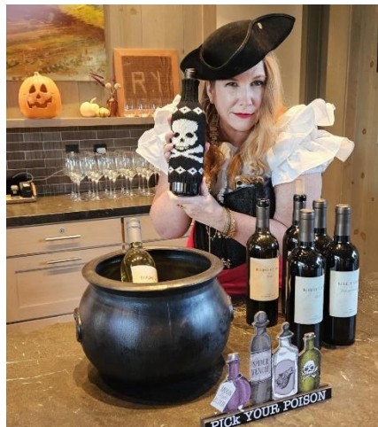
Pick your Poison

Regular Tuesday meetings at the Villa Chanticleer Annex.