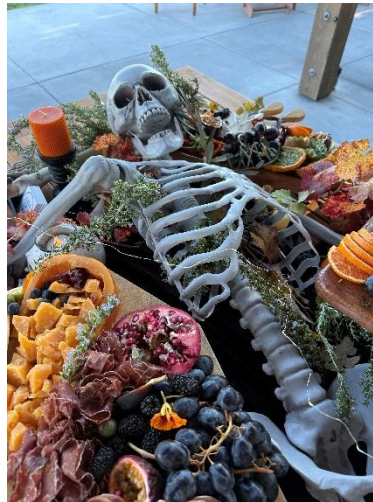
Grazing board by Field and Farm