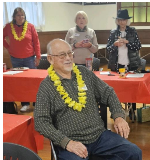
Jerry asked all ladies under 91 to sing Happy Birthday