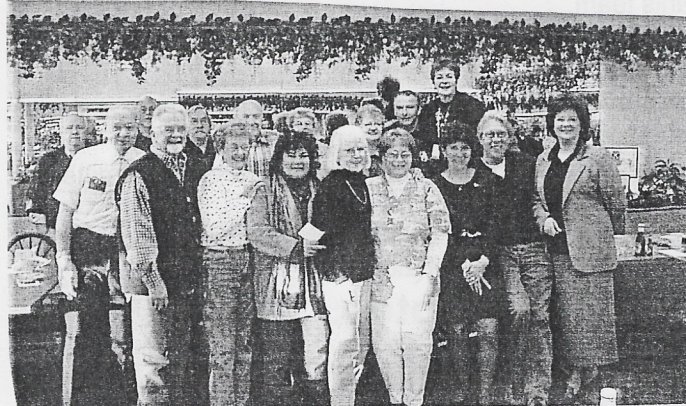
8 Healdsburg Kiwanians shown here with Cloverdale members at the interclub meeting on February 6.

Race go to the Healdsburg Kiwanis Memorial Scholarship Fund, with the income utilized for scholarships to go to Healdsburg High School graduating seniors. Last year the club awarded 4 scholarships, each worth $1500.