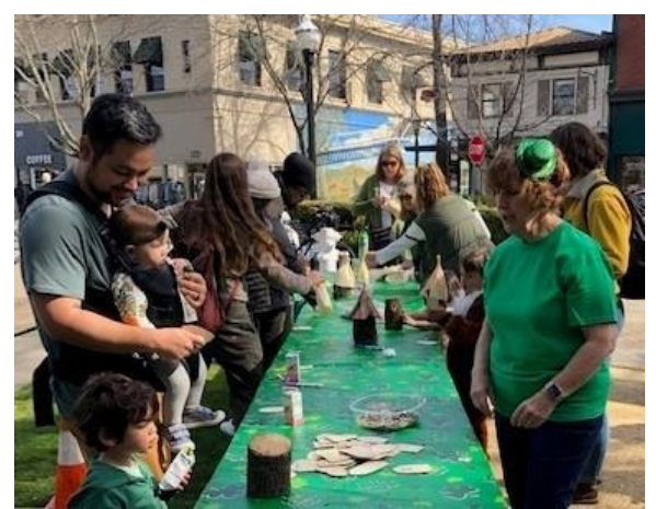
The Fairy House creation shop