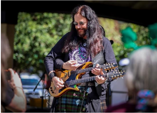
The Tempest Celtic rock band