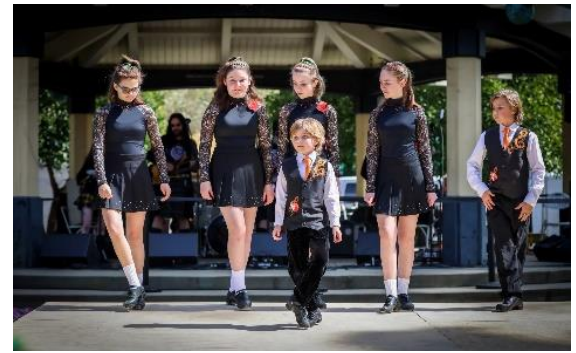
The West Shiloh Step Dancers