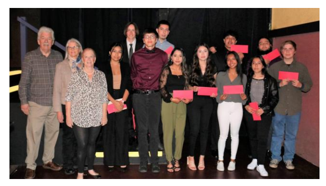
The 2022 Vocal Scholarship winners

It's almost that time of year for our scholarship committees to be receiving and evaluating scholarship applications from HHS graduating seniors.