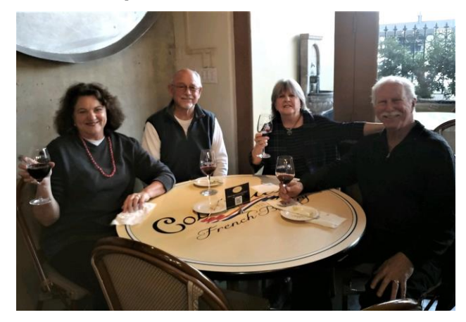
The Strongs and Giannis always enjoy a good party