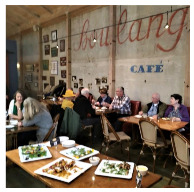
A crowd of about 45 enjoy the party

Mar 28 : Evening Meeting at Costeaux Fresh Bakery and Cafe - Social meeting and opportunity to discover a local treasure.