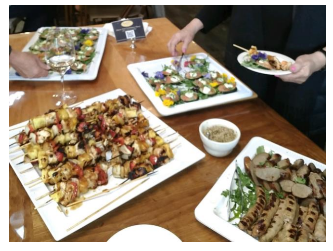
A spread of delicious treats