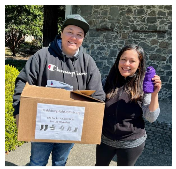
Reach for Home volunteers accept our donation of over 100 socks for the homeless