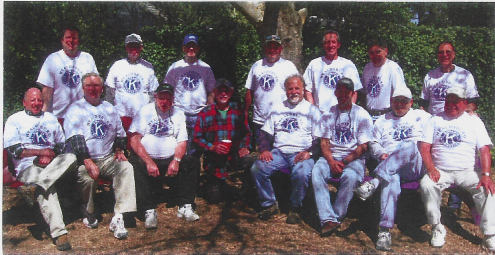
The Kiwanis One Day Crew

In years past the club participated in this program by planting trees at Fitch Mountain School, cleaning up the grounds of the old cemetery at Oak Mound and cleaning up weeds etc at the old railroad depot.