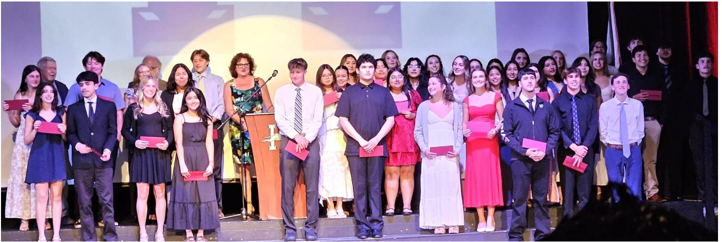
The 43 Healdsburg Kiwanis Scholarship awardees following the presentation