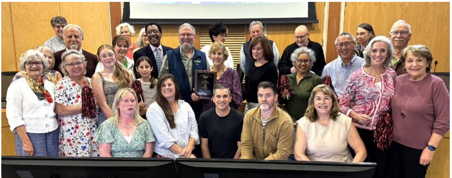
Award Presentation at City Hall April 6, 2026