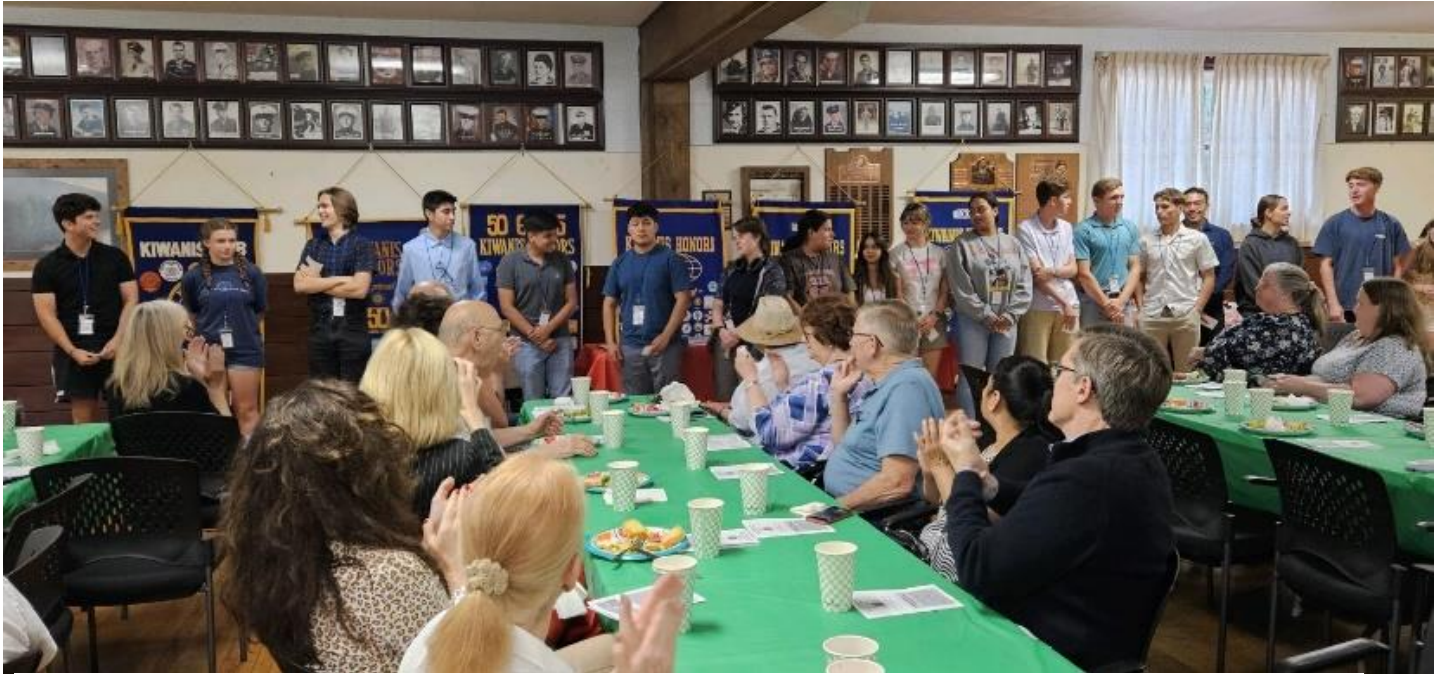
A huge round of applause for the Students of the Month

This year marks the 99 th annual tradition of honoring Healdsburg High School Students. Kiwanis members welcomed the 2023-2024 Kiwanis Students of the Month to our May 21 lunch meeting. A male and female student is honored for each month of the school year for a total of 20 students. Some of the students were accompanied by parents or other family members making for a large crowd. Each student was asked to introduce themselves and accompanying family, and tell us about highlights of their HHS career, most influential teacher(s), internship assignments, and plans for next year. They were also asked to tell us where they would like a time machine to take them.