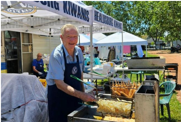
Impresario, Denny also a fry cook