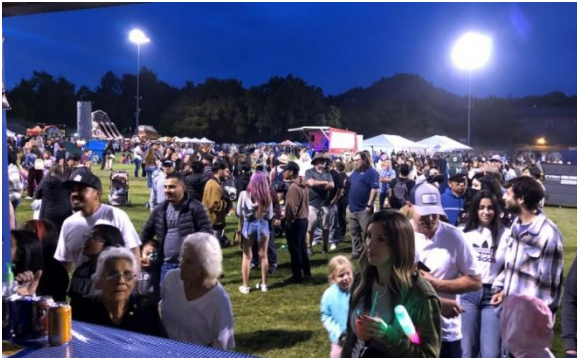
The Thursday pm crowd lines up for food