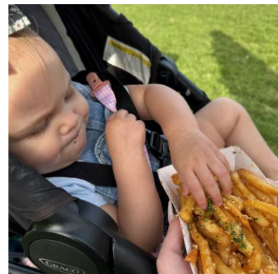
Trying her first garlic fry. She made a face of surprise and then ate 10! We have a new customer for life.