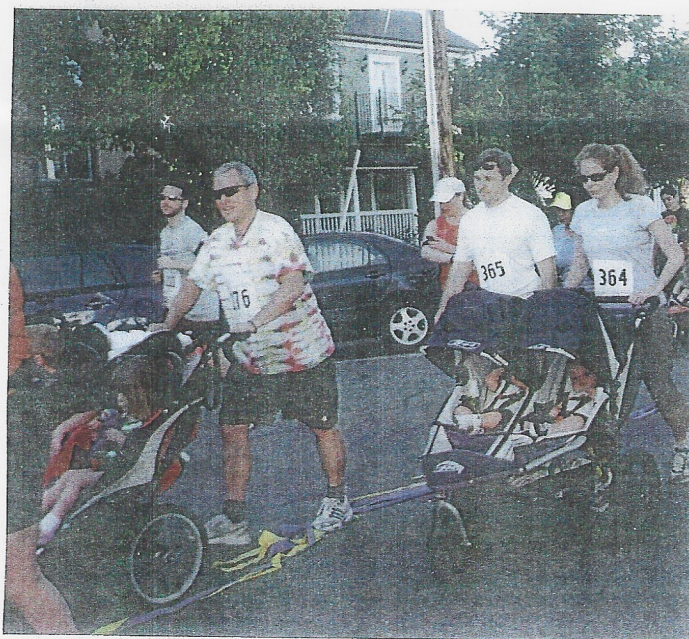
Young and old took part in the annual Fitch Mountain Foot Race held Sunday June 13.