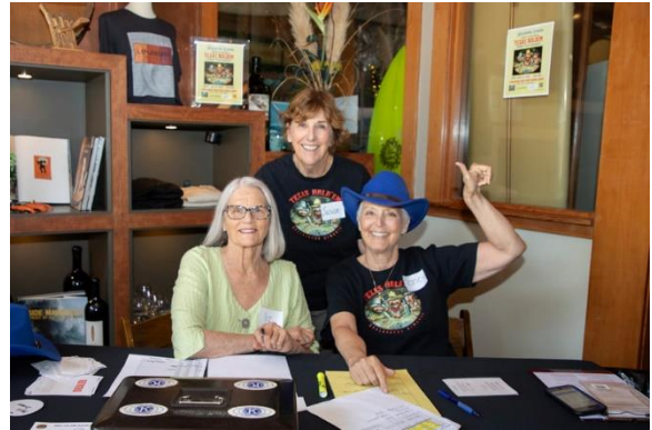
The Welcoming Committee

Everyone had a great time for a great cause!