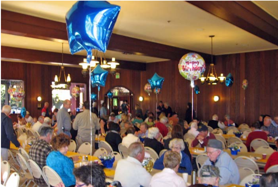
View of the Crowd Enjoying the Pancake Breakfast

The 57 th annual Healdsburg Kiwanis Pancake Breakfast was held on Palm Sunday, March 24 at the Villa Chanticleer. An estimated 750 to 800 people enjoyed all-you-can-eat pancakes, sausage, scrambled eggs, juice and coffee.