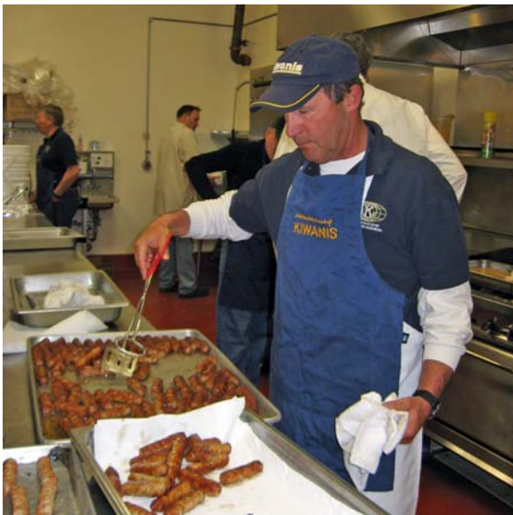
Hunt Cooks the Sausage