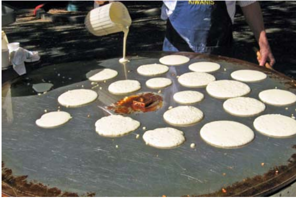
Pancakes on the Griddle