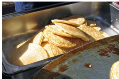
Pancakes Ready to Serve

The pancake breakfast is one of our major fund raisers. Proceeds from the event are unavailable but will be included in next month's newsletter.