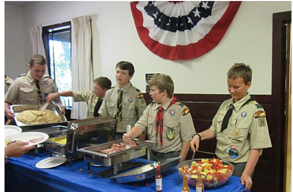
Troop 21 members serve at the Boy Scout's July 4 Pancake Breakfast