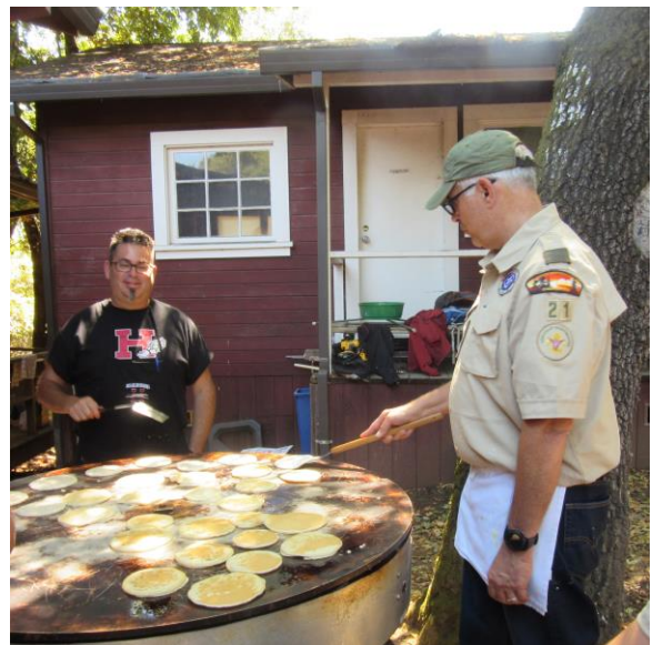
The dads flipping out