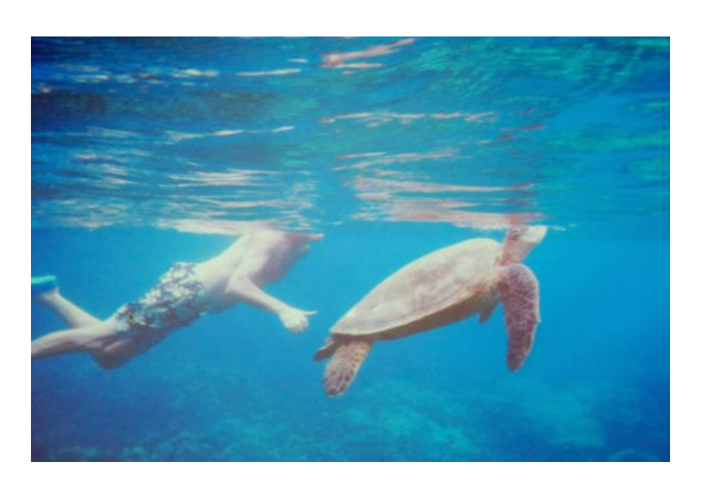
Roger flies with a turtle