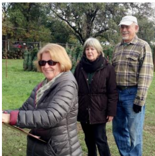
The tally crew