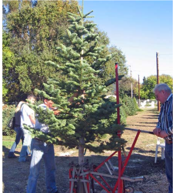
Drilling a Tree Trunk for Stand