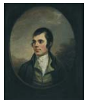
Naysmith portrait of 1787 Scottish National Portrait Gallery

Robert Burns was born on January 25, 1759 south of Ayr in Alloway, South Ayrshire, Scotland. He was a Scottish poet and lyricist, widely known as the national poet of Scotland and is celebrated worldwide.