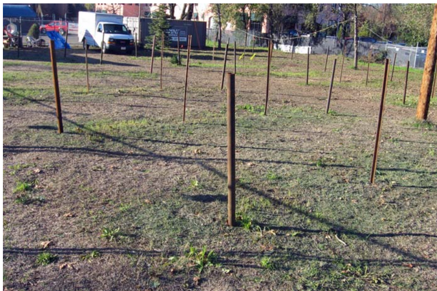
Healdsburg Kiwanis Club Tree Lot as it Appeared on December 18, 2012

The above photo shows the successful conclusion of Christmas tree sales at the Kiwanis Club tree lot for 2012. All of the 1260 trees, except for six small trees in poor condition were sold by Monday December 17. The lot was closed the following day, seven days earlier than planned. The early sell out is probably due in part to the one week longer than usual selling period between Thanksgiving and Christmas and also to the improving economy.