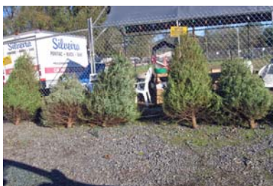
Remaining Trees 12/18/12

The above photo shows the successful conclusion of Christmas tree sales at the Kiwanis Club tree lot for 2012. All of the 1260 trees, except for six small trees in poor condition were sold by Monday December 17. The lot was closed the following day, seven days earlier than planned. The early sell out is probably due in part to the one week longer than usual selling period between Thanksgiving and Christmas and also to the improving economy.