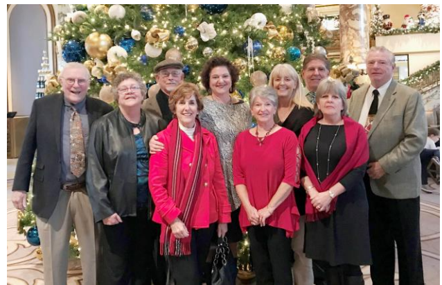
The Healdsburg Kiwanis group attending the annual San Francisco Kiwanis party at the Fairmont Hotel