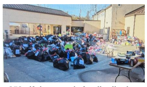
353 gift bags ready for distribution