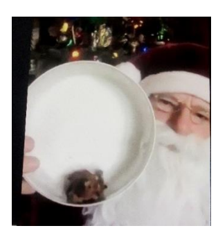
!#@$ Elves ate my fruitcake

A shippment of vaccine was received at the North Pole recently. The elves opened the package and one of them popped off the top of one of the vials. Looked and smelled like gin and it was gin. So the elves popped off all the tops and had a grand party. So the drunken elves caused much confusion and naughtiness. Editors note: One of the elves on condition of anonymity reported that Santa also participated.