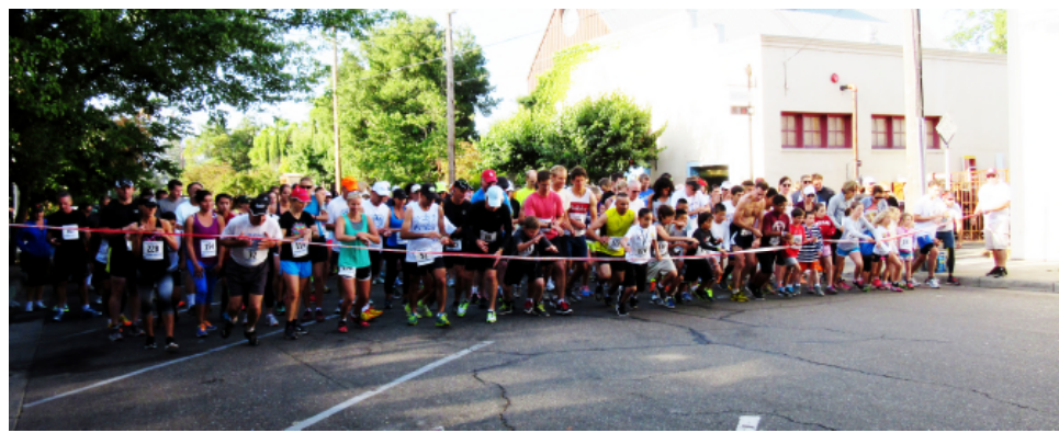
The Runners at the Starting Line

About 220 runners finished the 10k and 3k courses of the 36th annual Fitch Mountain Footrace held on June 8. The event went off very well thanks to the effort of event chair David Jones, the event committee members, the many club members needed to monitor each intersection along the race course and Boy Scout Troop 21 members who manned the water stations. Special thanks to the event sponsors (See photo of back of tee shirt below) participating at the $250 or $500 level without whom the race could not occur.