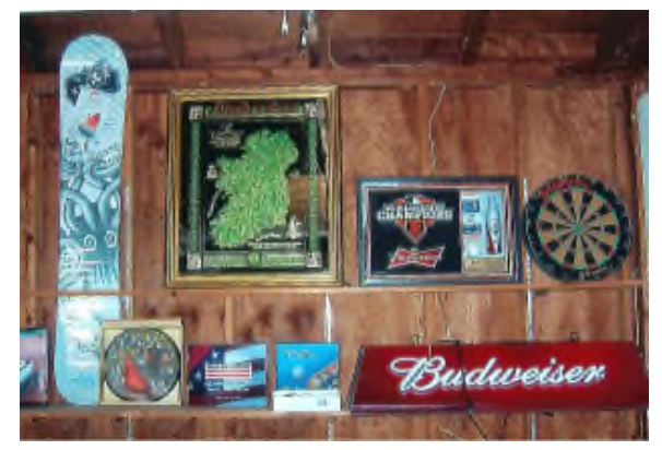
Some Silent Auction Items Collected So Far Snow board (Left), Budweiser overhead light

Members are urged to look around their garages, closets or other hiding places to find items to donate to the silent auction at the Brandt's Beach BBQ. Live auction items are also needed. Contact Dennis Stead.