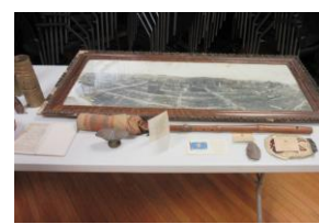
Aerial photo following SF Earthquake