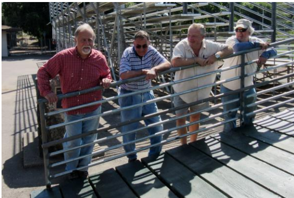
Supervising the last gallon