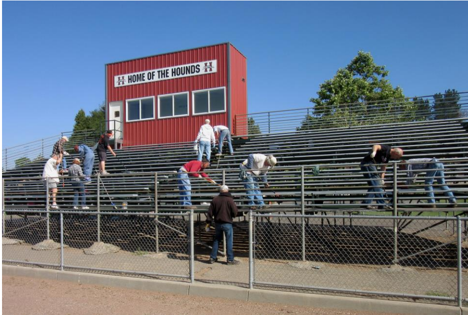
The busy Kiwanis crew painting the bleachers

“Kiwanis members serve their communities all year long. But the excitement for service really builds in April each year when Kiwanis members come together for Kiwanis One Day - a day of community service that is felt around the world.” (Kiwanis website) For this year’s K1 day, our club, aided by Key Club members and Salvation Army men, performed some needed rehabilitation work at Giorgi Park. A crew of 14 Kiwanians and 2 key clubbers spread about 8 gallons of paint on the football bleachers, from the top down . Kiwanians last painted these bleachers in 2011 and they were badly in need of new paint. Along with this effort, a crew of 12 Salvation Army men was hauling and spreading wood chips on the playground and picnic area. A pizza lunch was enjoyed upon completion of the work. More photos on page 5.