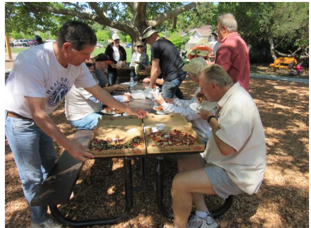
Pizza for lunch