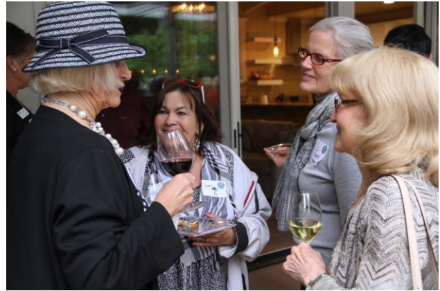
Mixer photos by Rick Tang