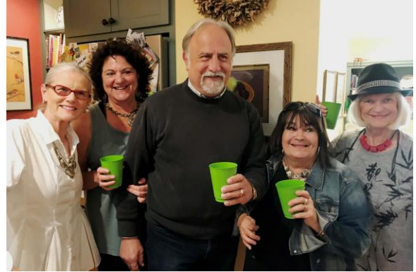
Look who crashed the party? He has sworn to secrecy!